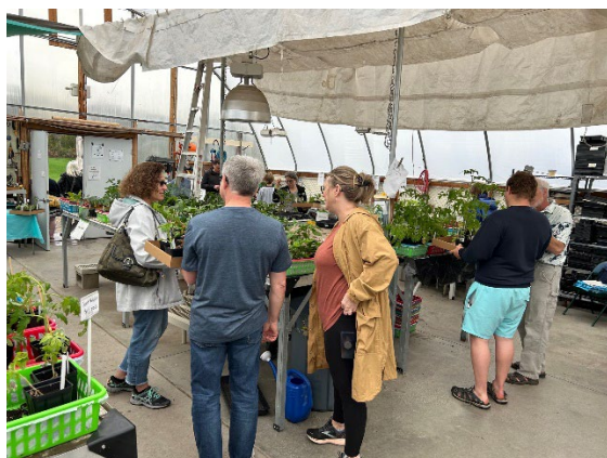
(Shoppers at Spring Plant Sale, NPBGS Greenhouse)

Our annual Spring Plant Sale was held on May 13 th . A diverse offering of flowering annuals, perennials, vegetable plants, and herbs were offered for sale and totaled 227 varieties. NPBGS' Spring Plant Sale offers the public an additional shopping venue in north Fargo for seasonal plants, with experienced volunteers who provide useful gardening tips to the buyers. We thank Don DuBord, who organized and coordinated the plant sale, and the numerous volunteers and plant donors.