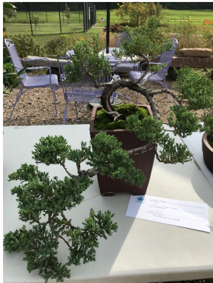
(Bonsai, Nana Juniper)

The first Bonsai in the Garden event was held at the Northern Plains Botanic Garden on September 9 th . The public was invited to tour the completed Phase 2 pathways and hills north of