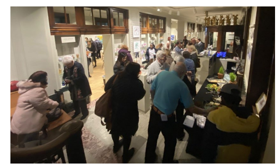
25th Anniversary and Annual Meeting Attendees