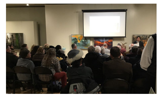
Sadafumi Uchiyami addressing the audience