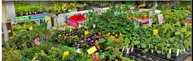
Proceeds benefit the Northern Plains Botanic Garden Society

The NPBGS Plant Sale will offer annuals, perennials, wildflowers, raspberries, strawberries, pollinator plants, groundcovers, shade plants, vegetables and perhaps a few more surprise varieties.