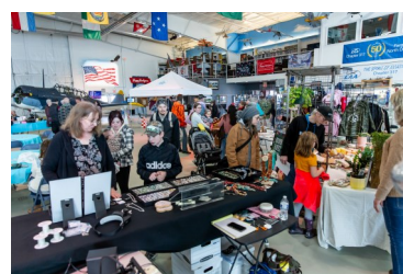
Annual Affaire Vendors