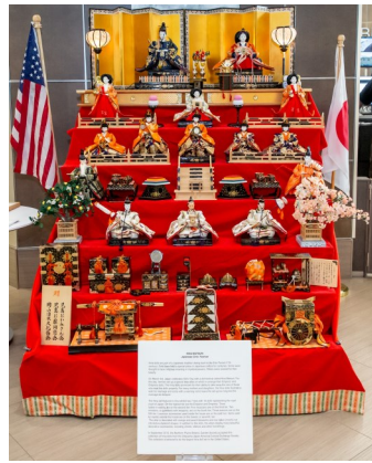
The full Hina Matsuri doll display