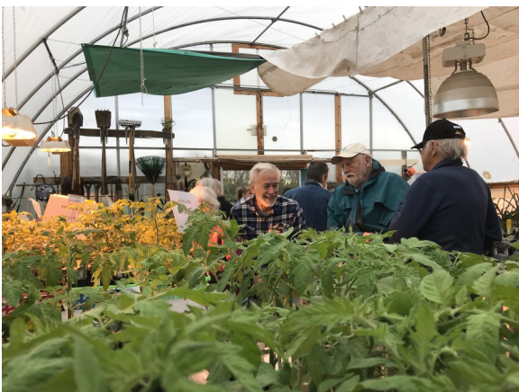
Discussing the merits of tomato varieties