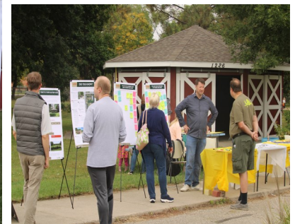
Visitors getting involved and sharing their ideas