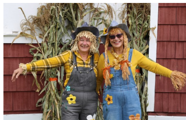
Having fun at the Scarecrow Event!