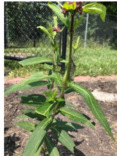
Monarch larvae on Swamp Milkweed