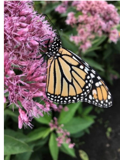
Monarch on Joe-Pye Weed