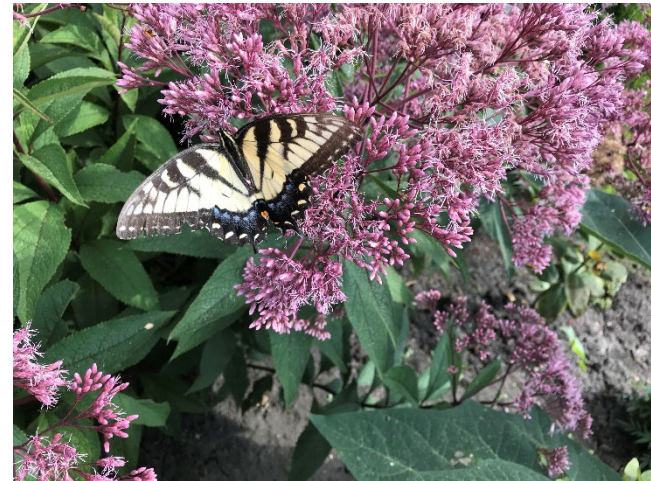
Eastern Swallowtail Butterfly on Joe-Pye Weed, Butterfly Garden