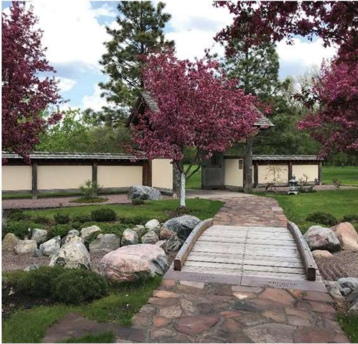
JAPANESE GARDEN OF MIND AND SOUL AT THE NORTHERN PLAINS BOTANIC GARDEN