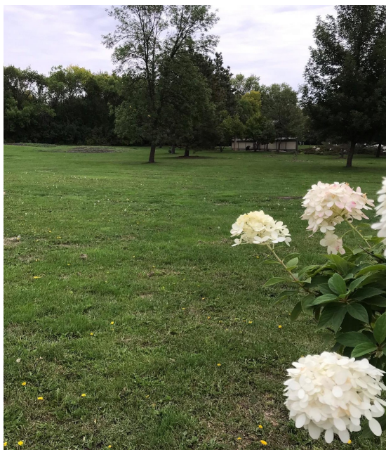
A view of the future Japanese Garden site from the location of the tree hydrangea donated and planted by Marilyn West

Members: Please consider serving on the Board. This is a valuable way to help our society achieve its long-term goals. We want your talents!