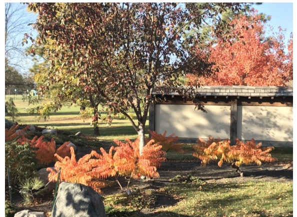
The Japanese Gate with the sumacs in fall color.