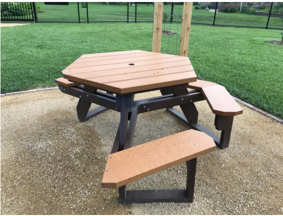
New accessible picnic table in Edible Forest