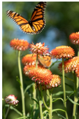
Sensory Garden new signage and paths