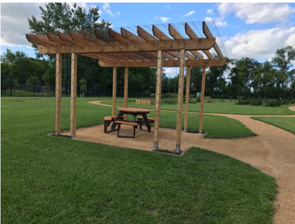
Kiwi vine pergola will shade the picnic table