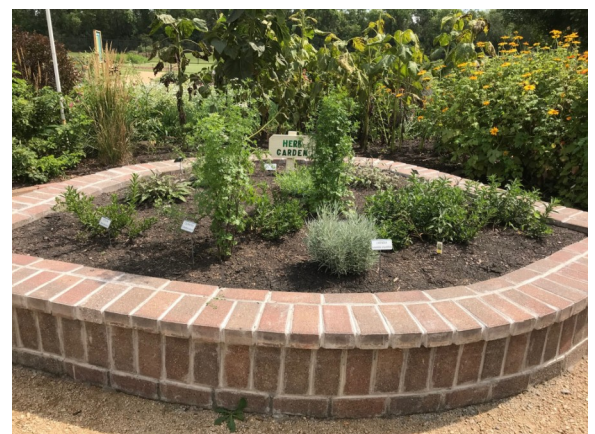
The new herb planter designed by Lou Worner is eye-shaped to fit the sensory garden theme