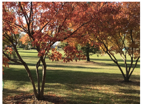
Fall color in the garden.