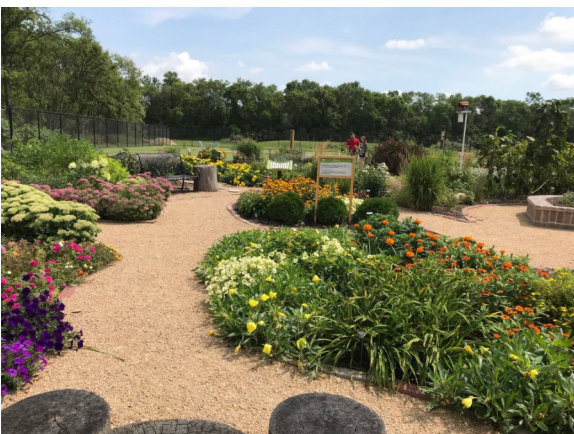
Sensory Garden viewed through the Sight section looking towards the Sound section