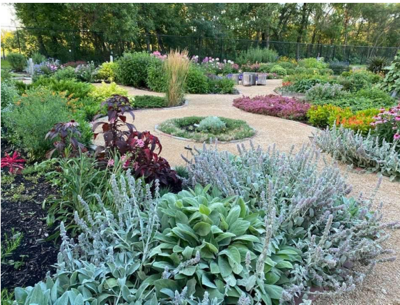
View of the Sensory Garden from the Touch section