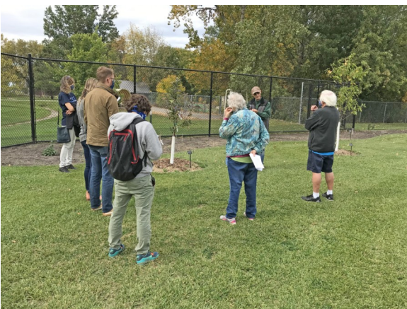
Visitors learning about the diverse varieties of fruit and nut trees, shrubs and vines growing in the Edible Forest.