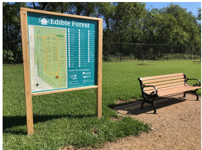
New interpretive signage inside Edible Forest

With a fence around both the Edible Forest and connecting paths, NPBGS has begun the process of integrating the various garden areas that will comprise the Botanic Garden.