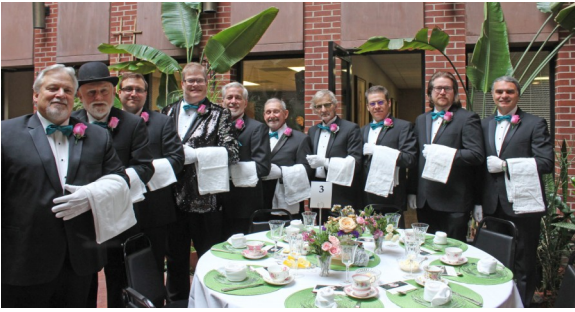
The butlers are ready to serve tea

On behalf of the Northern Plains Botanic Garden Society Tea Time at the Atrium Committee I extend a heartfelt thanks to all the fabulous volunteers who made the 7 th annual tea fundraising event another great success.