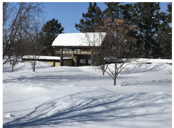
The garden site waiting for spring work to begin