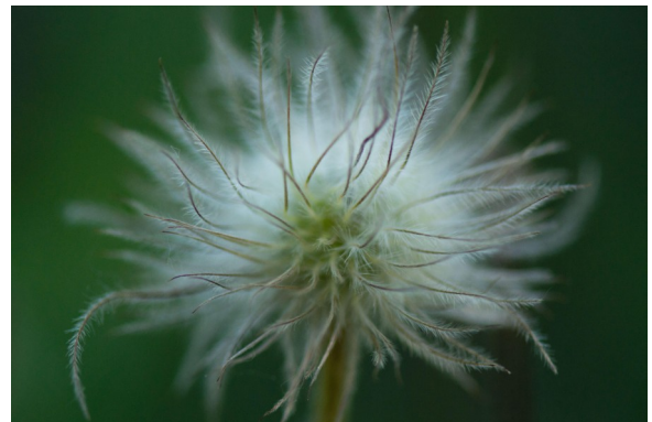
Rebecca Lyon's photo of a flower gone to seed