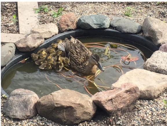
Lou Worner's photo of ducklings in the lily pool in the letter W of the Children's Garden